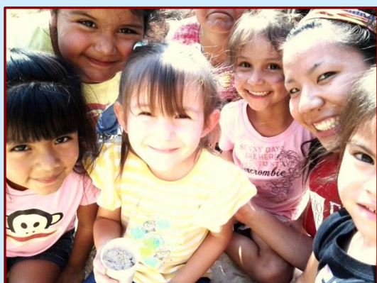
With some of the 4 year old students at the Guadalupe Center- in the sandbox!

-I also engaged on two Buck-i-Serv trips my junior year, which are week long service learning trips offered to all OSU students. During spring break, I traveled (by van) 16 hours to Immokalee, Florida, where I volunteered