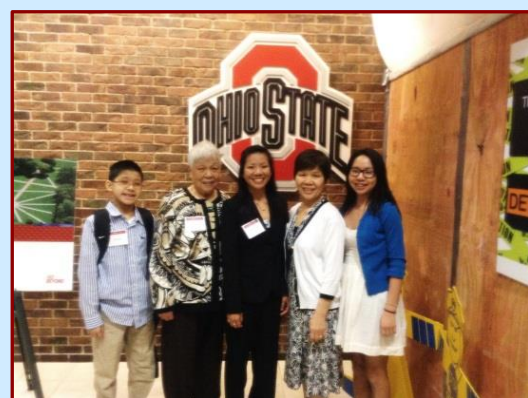
At the Pace Setter's award ceremony with my younger siblings, mother, and grandma

-Back at Ohio State, I was recognized with the Pace Setter's Award this year from the college of Business, which, "As the college's top honor, the Pace Setter awards celebrate those students who excel both in and out of the classroom and who exemplify the purpose and passion that define Fisher students and graduates". It was humbling to know that my efforts both inside and outside the classroom were appreciated. It was also great to receive this award alongside the students and faculty with whom I work with on a daily basis for these involvements!